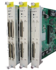
E1(75 ohm) 16, 32 and 63 Ports Interface Cards