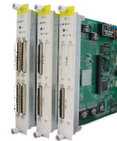
E1(120 ohm)/T1 16, 32 and 63 Ports Interface Cards