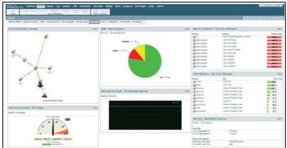
WhatsUp Gold provides a unified view so you can see everything on your network.

WhatsUp Gold Layer 2/3 Discovery identifies all of the devices on your network including your routers, switches, servers, and more. The product discovers the network using an IP Range Scan, from a Start and End IP Address. WhatsUp Gold also features SNMP Smart Scan which discovers all devices on the network by querying the "Bridge Table" on a core router.