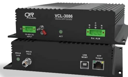
VCL-3086 – DIN Rail