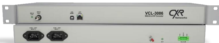
VCL-3086 – 19 Inch 1U Rack Mount