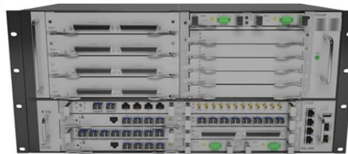
CXR-1400 - 7 Slot with expansion chassis